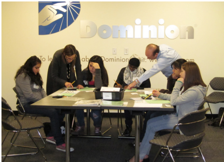
The Financial Services Roundtable

This flyer is just one example that depicts what all our companies do every day. The financial services industry provides extraordinary services to communities throughout America. Employees of Roundtable companies volunteer 52 weeks a year for financial literacy, neighborhood improvement, fundraising, health care, child services, and much more. Every company in the Roundtable is involved in some way in community service in the communities they serve.