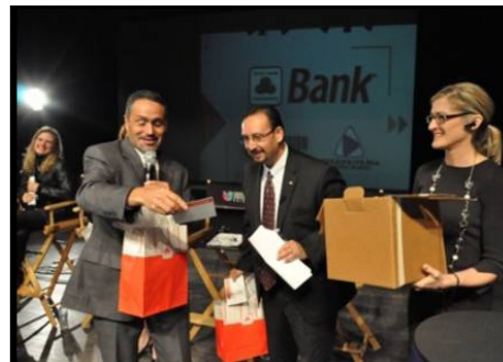
State Farm Insurance Companies