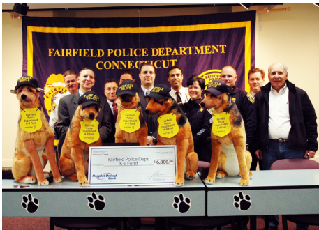
People's United Bank