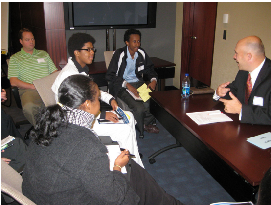
Allianz Life Insurance Company of North America